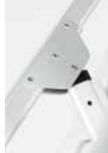
Double Reinforced Joints