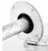
Hinged Spigot Installation