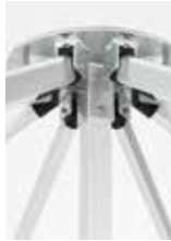
Telescoping Crank System