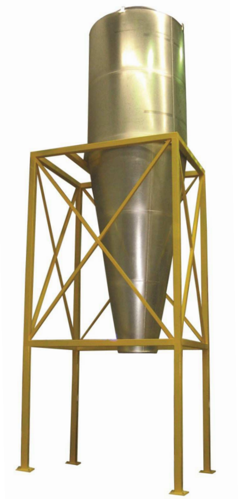
Nordfab model CV1800 Cyclone