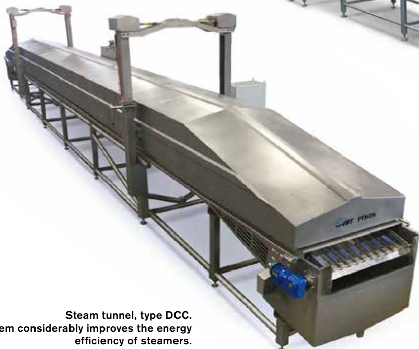
Steam tunnel, type DCC. The DCC system considerably improves the energy efficiency of steamers.