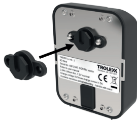
Klick Fast Stud

As standard, the Alligator Clip is supplied with the XD One stabilitys trap for chest mounting. When ordering XD One devices with the Klick Fast Stud, please also order the relevant mounting kit below.