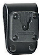
Belt Loop Dock