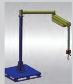
Portable Base Plate