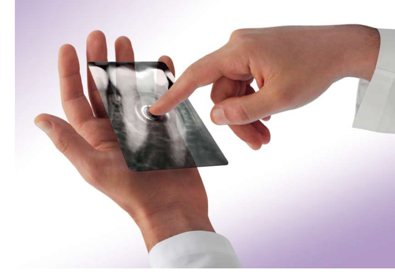
Free to imagine