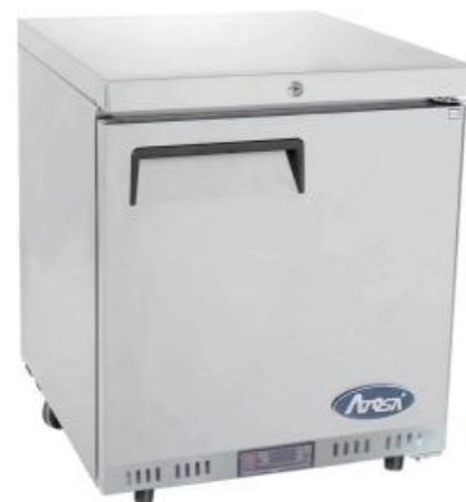
Chiller/Freezer Cabinet MBC24F/MBC24R