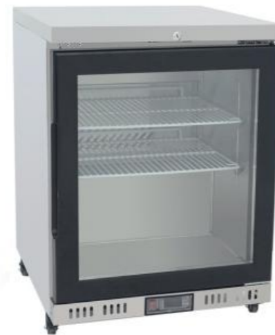
Chiller/Freezer Cabinet MBC24FG/MBC24G