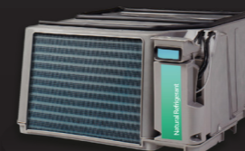
Quicker, safer servicing