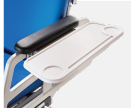
Folding Side Table (TMA223-15)