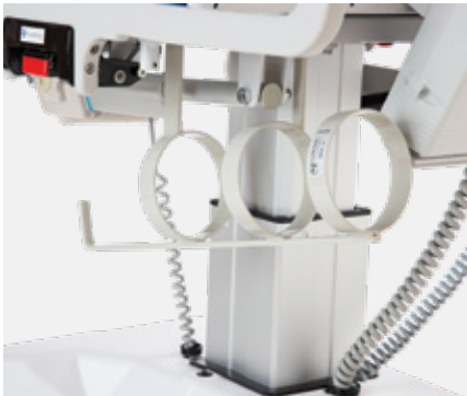
Oxygen Tank Holder For Non-X Models (TMA04-15)