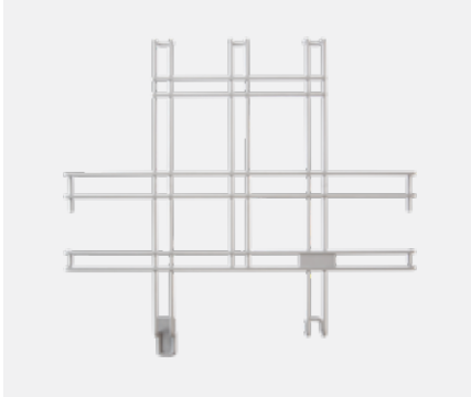
X-Ray Cassette Holder Standard Width (TMA101-15) Wide Width (TMA101W-15)