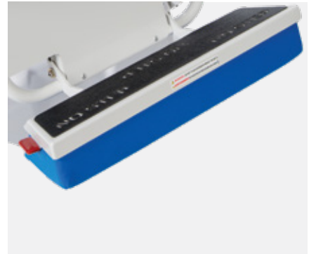
Manual Folding Footrest (F)