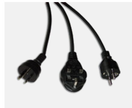
Export Plug-In (E)

120v / 60Hz A/C power with on-board charger & internal batteries