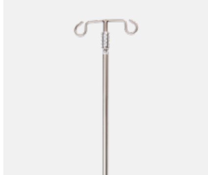
IV Pole (TMA03-15)