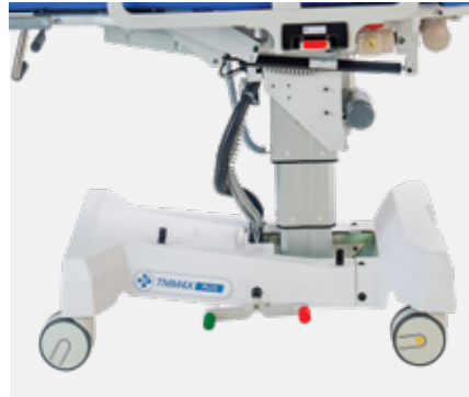
Triple Column Base (T) 24" - 40" Seat Height