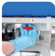
Manual Quick Release Back

Available in Sure-Check® Fusion Fabric or Healthcare-Grade Vinyl