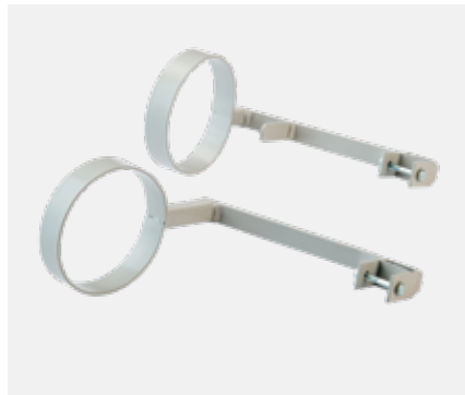
Oxygen Tank Holder For X-Models (TMA04X-15)

Additional configuration & accessory options available