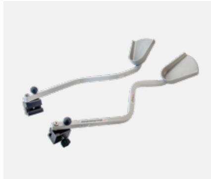
Heel Stirrups (TMA169-15)