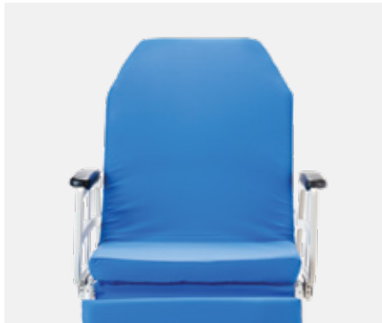
Wide (28") Seat Width (W)