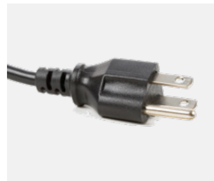
A/C Plug-In (A)

*models with this configuration will NOT have a radiolucent back