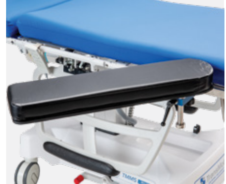
Locking Armboard: Stretcher (TMA121-15)