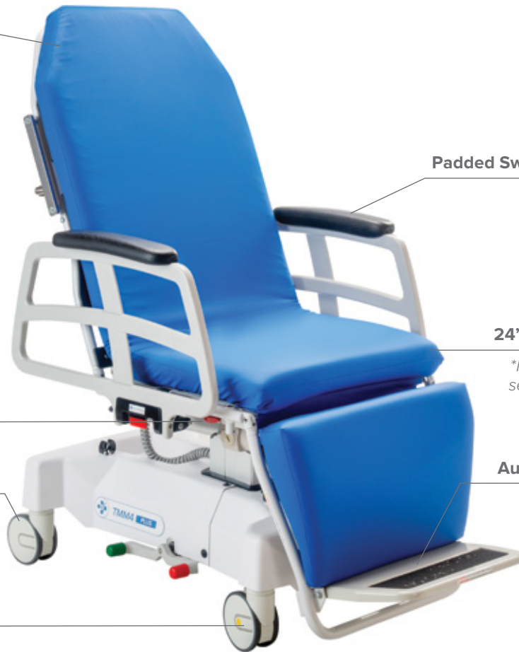
Electro-Static Discharge (ESD) Steering Caster