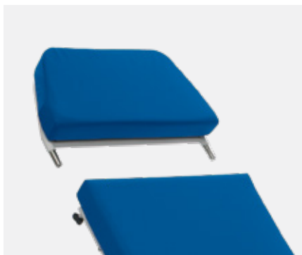
Removable ENG/VNG Headpiece (G)

*models with this configuration will NOT have a radiolucent back