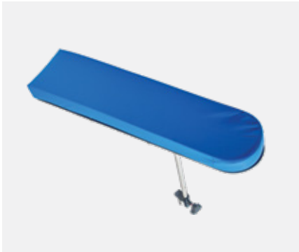
Armboard: Seated (TMA65-15)