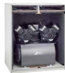
Soundproof cabinet, large