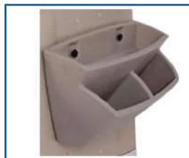
Multi Cavity Storage