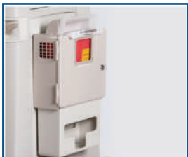
Sharps & Glove Holder