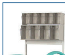
Tilt Bin Organiser