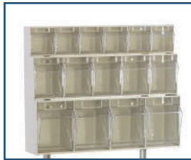
Large Tilt Bin Unit