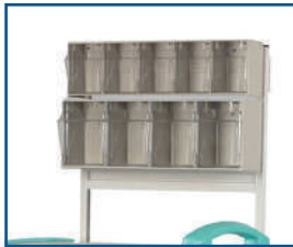
Tilt Bin Organiser