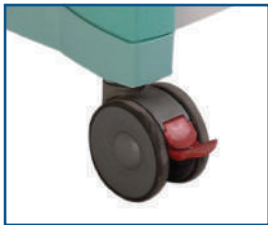
Double Wheel Castor