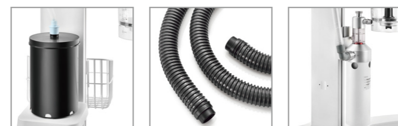
Gas filter canister Passive scavenging Active scavenging