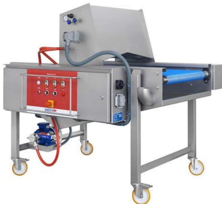
Standard BAKON disc machine

Referring to your request, and the information provided, we have the pleasure to send our quotation for a BAKON disc spraying machine for Puratos sunset glaze. The disc machine is running from left to right seen from the display