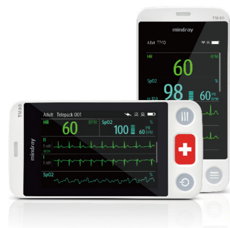
Landscape and portrait display mode, easy to read.