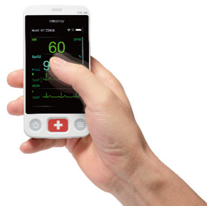
3.5" capacitive screen, operating like a phone, easy to learn.