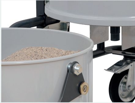
Solid cut-off system