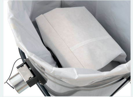
Optional safe bag