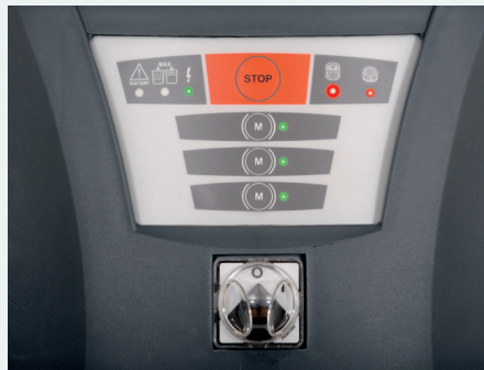
Electronic board control