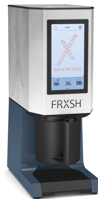
FRXSH Mousse Chef with protective beaker