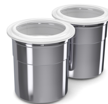
2 Chrome steel cups with sealing cap