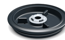
Splashguard and ringscraper