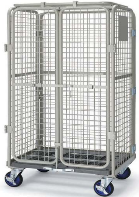
Fully Lockable Security Models