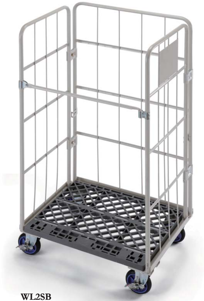
WL2SB Open Front