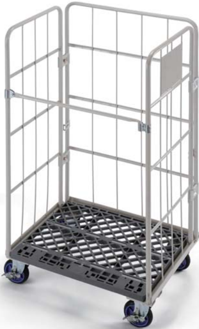
Standard Models With bar

Choose from a wide variety of features and sizes, including models equipped with a lock, cool insulation cover and weather-proof covers.