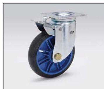
Directional Lock Castor