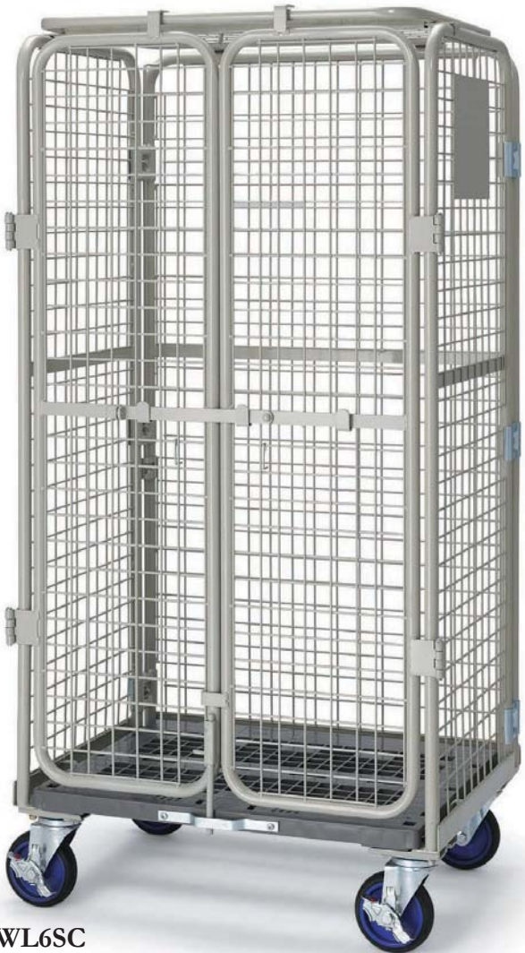
WL6SC Security Style