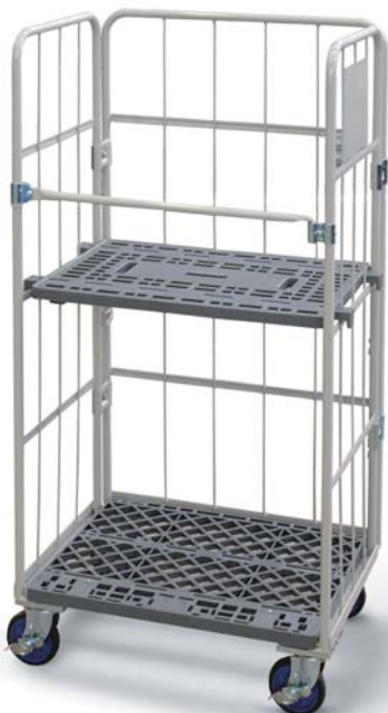
Shelves Plastic or Steel