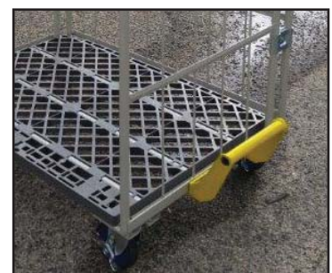
Tow Hitches for Tugs