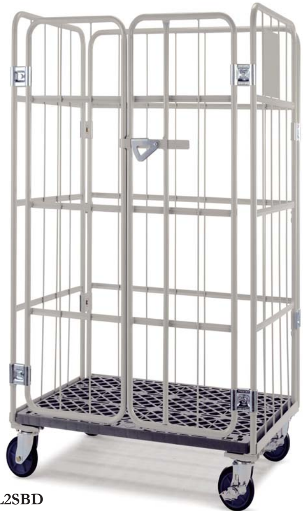
WL2SBD Double Doors