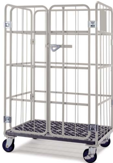
Double Door Models