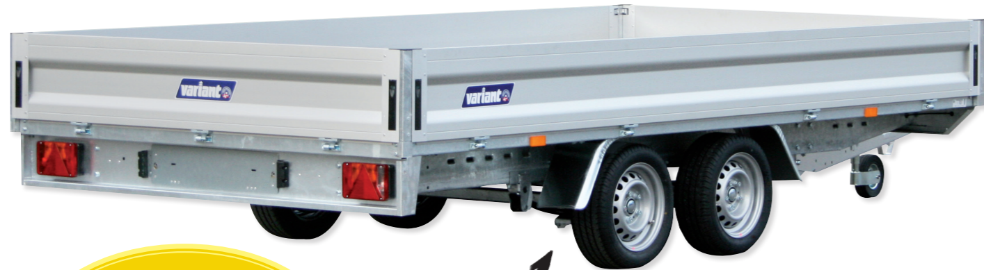
( Model shown 3521 X4 )

Leaf springs provide extra strength and durability. Also at maximum load..!