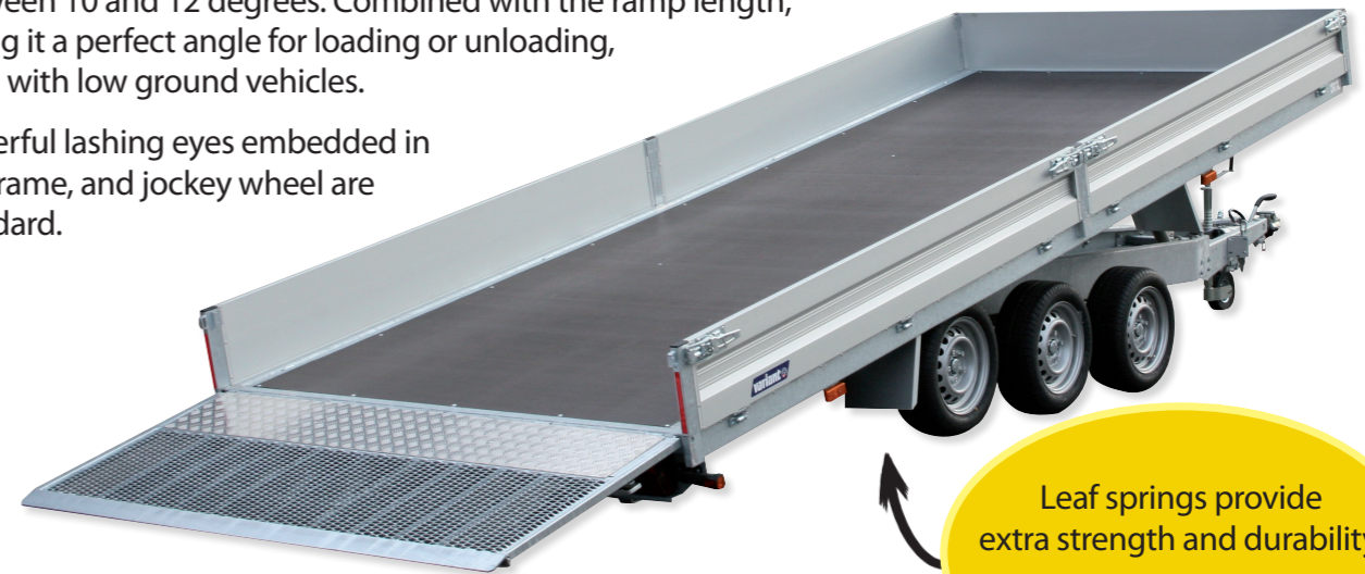
( Model shown 3553 UX )

Leaf springs provide extra strength and durability. Also at maximum load..!