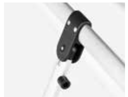
HIGH IMPACT RESIN JOINTS