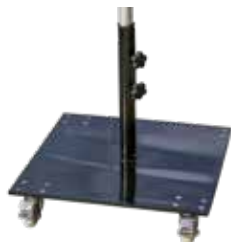
HEAVY BASE PLATE WITH WHEELS