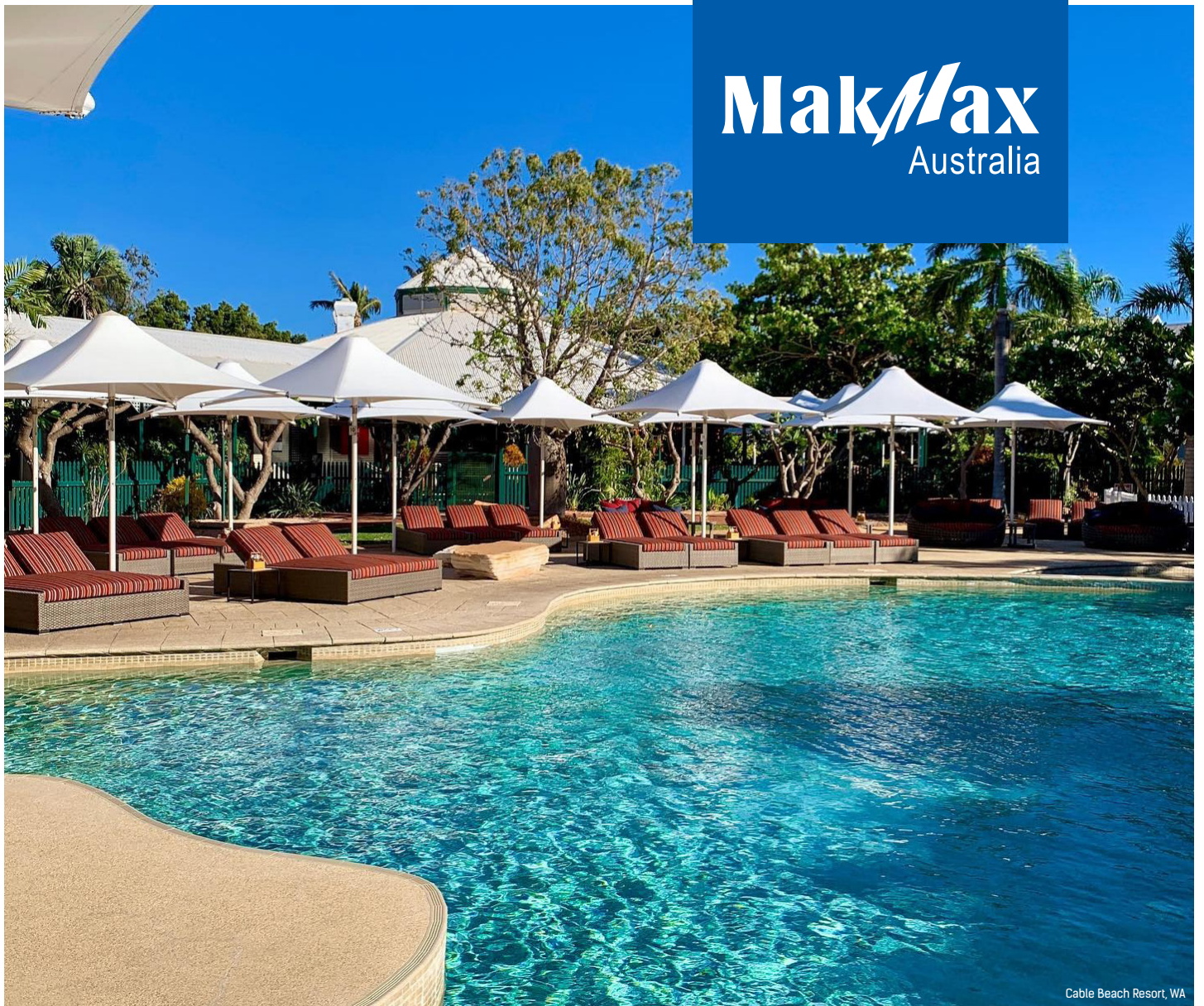
Cable Beach Resort, WA