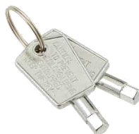
Keys x 2