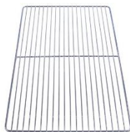
SHELVES x 3