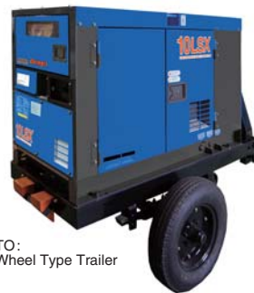
PHOTO: Two Wheel Type Trailer

Trailers can be fitted to the generators to facilitate on-site movement.