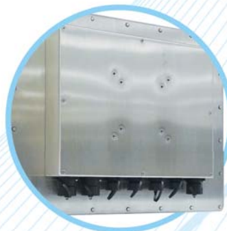
Waterproof Circular Connectors