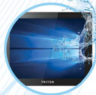
IP66 Certification Fanless & Ventless