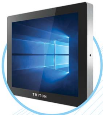
Stainless Steel SUS 304 Chassis