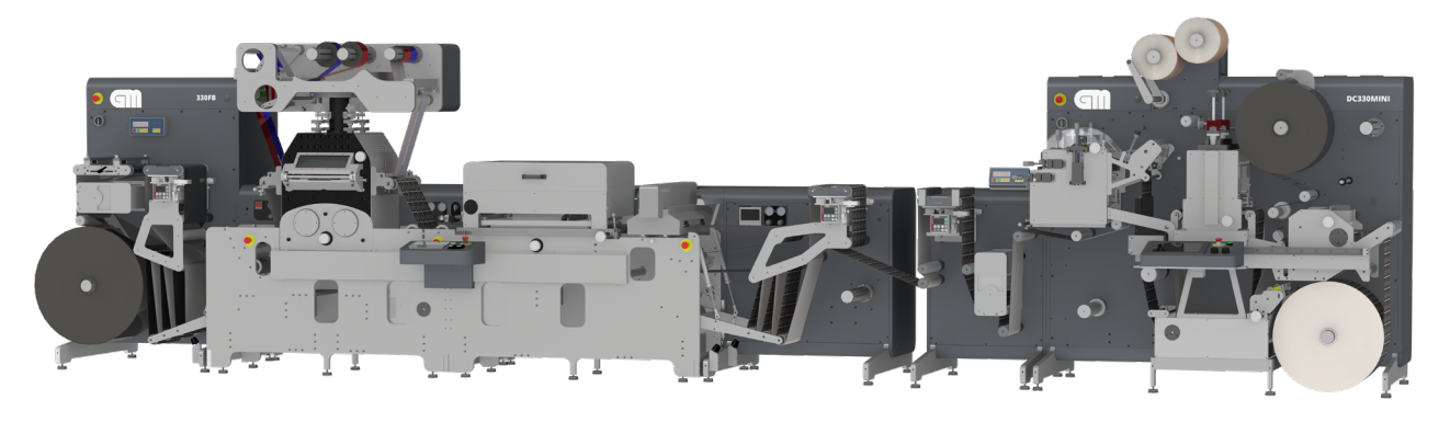
Runs inline with GM Hotfoil/Screen embellishment units

GM Buffer - easy switching between inline and offline mode. It synchronizes the speed between digital press and finisher, and allows operator time to change the roll.