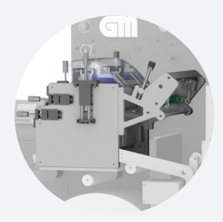
The UV Flexo varnish station with optional registration allows the higher level of embellishment with spot and Super Gloss varnish.