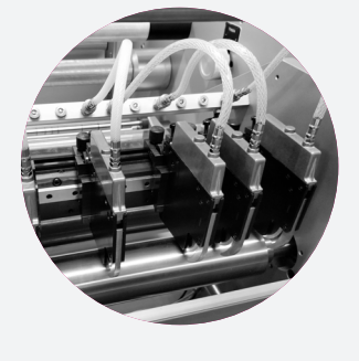
GM SmartCrush - An ultra-quick set knives system, allowing fast and precise setting of each crush knife – also while running.