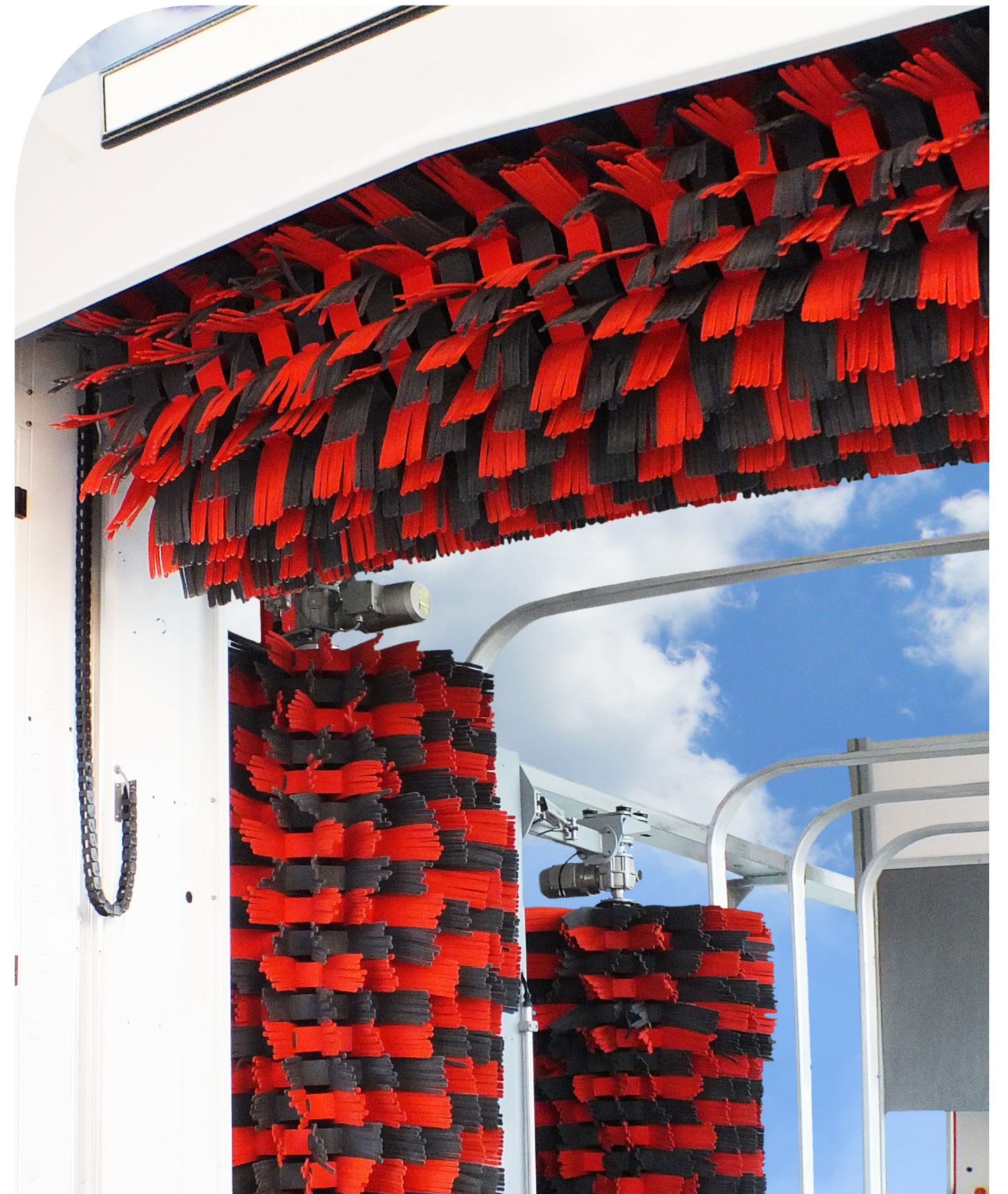
ISTOBAL T'WASH10 On the car-wash cutting edge