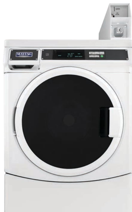
COIN DROP OR CARD READER READY MHN33PD (pictured)