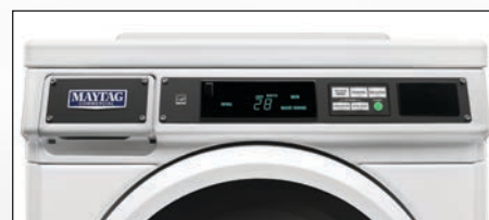
NON-COIN MHN33PN (pictured)