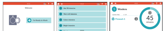
Approach, program and running cycle screen