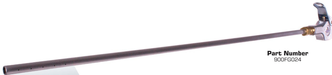
Part Number 900FG024