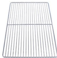
SHELVES x 3