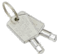
Keys x 2