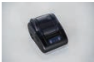
Label or LOG printer(option)