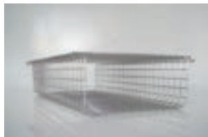
U-shaped steel wire basket