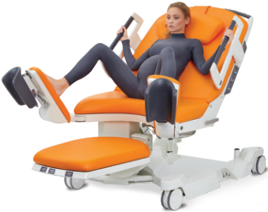
Semi recumbent position with the feet rested on the leg rests