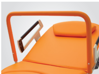
Supporting upholstered bar