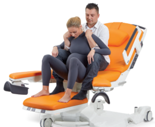
Half sitting with partner assistance