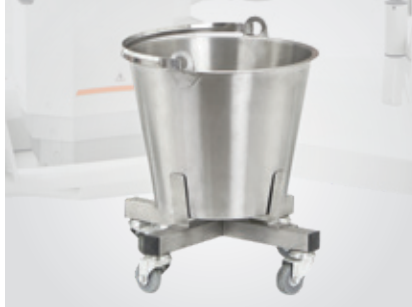
Stainless steel bowl with castors