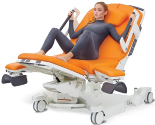
Semi recumbent position with the feet rested on the foot section