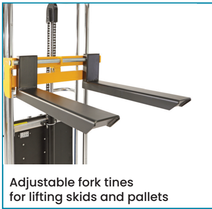
Adjustable fork tines for lifting skids and pallets