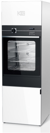
IQ4 8 DIN TRAYS H:1810 x W:600 x D:700mm