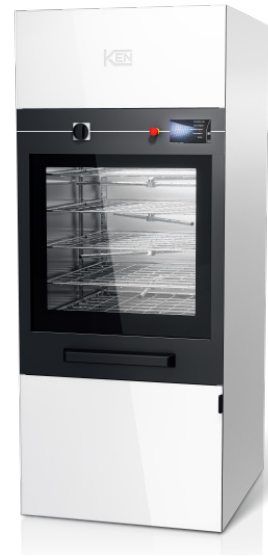
IQ6 18 DIN TRAYS H:1985 x W:820 x D:936mm