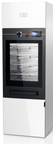
IQ5 12 DIN TRAYS H:1985 x W:662 x D:711mm