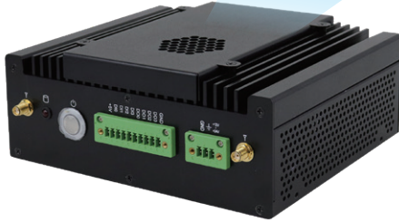
Hailo-8™ M.2 AI Module