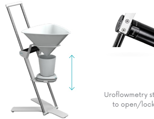
Portable version with a folding stand

Uroflowmetry stand is easy to open/lock and adjust the height.