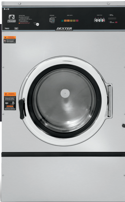
6 Cycle Control