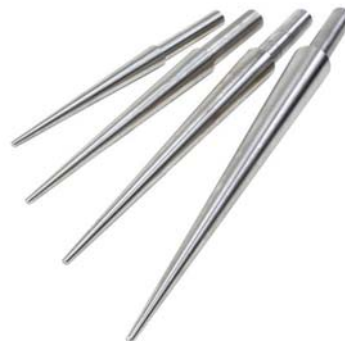
Darts for EDG