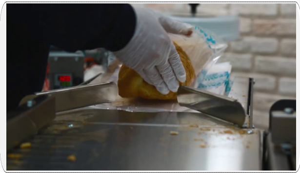
Working Principal: Sliced bread is put into the bag which is opened by a blower fan.