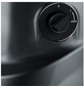
Order no. 9009760 black