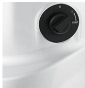
Order no. 9009761 white

Other colors available on request from 50 units.