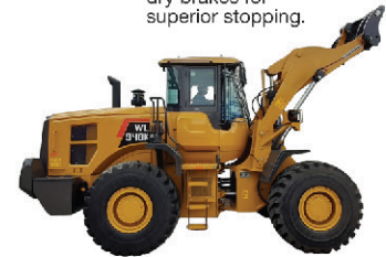
5.6 SECONDS 5.5T LIFT