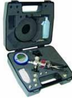
Hydraulic test kit

Includes: DPI 104; ranges to 15,000 psi (1000 bar), PV212 hydraulic test pump, hose, adaptors, seal kit and case.