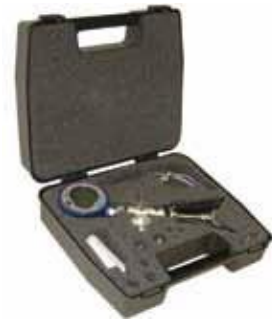
Pneumatic test kit