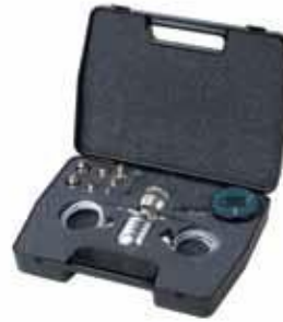
Low pressure pneumatic test kit

Includes: DPI 104; ranges to 30 psi (2 bar), PV 210 low pressure pneumatic test pump, hose, adaptors, seal kit and case.