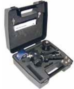
Pneumatic and hydraulic test kit