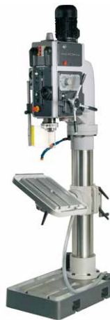
With rotating table plate and tilting support (MGI)