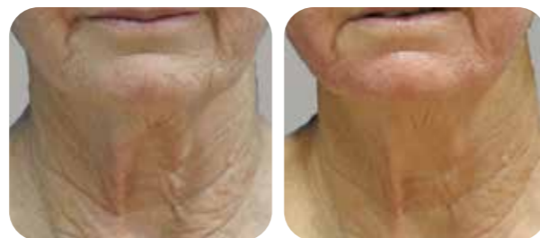
Before After 3 Treatments

These indications may also be addressed using the Quasi-Long Pulse Nd:YAG 1064nm laser which achieves neo collagenesis and skin rejuvenation through a photothermal effect.