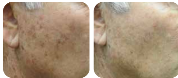
Before After 1 Treatment

ALMA-Q is highly effective for treating various degrees and depths of pigmented lesions as well as melasma. The high power Q-Switch Nd:YAG 1064nm laser treats deep pigmented lesions, while the monochromatic 532nm wavelength addresses superficial pigmented lesions. The treatment mechanically breaks up the melanin in the lesions without causing thermal damage, revealing lighter, unblemished skin.