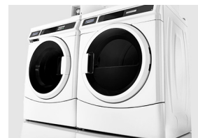
MATCHING WASHER AVAILABLE