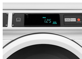
ONE-TOUCH CYCLE SELECTION