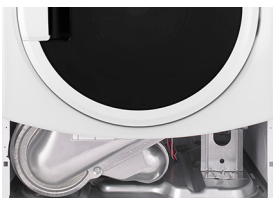
FRONT ACCESS PANEL