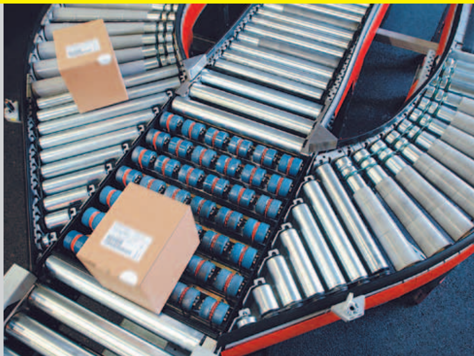
▼ High performance package - Merge