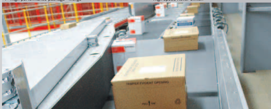
▲ High-speed Roller Switch