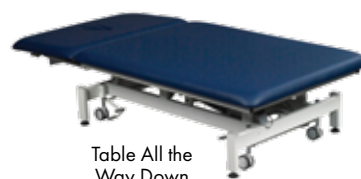
Table All the Way Down