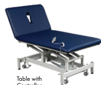
Table with Controller