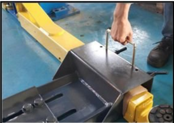
Concealed handle convenient for assemble.