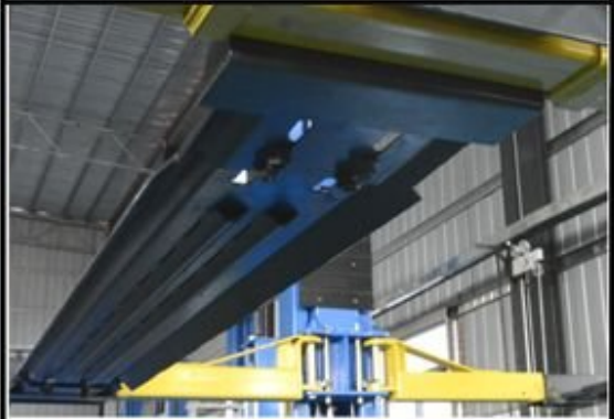
Strengthen wheel-support platform.