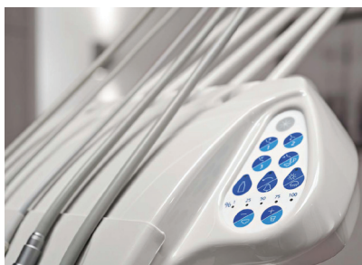
Traditional or Continental

The doctor table is equipped with Luzzani (or DCI) triplex syringe, electric micro motor, 2 high speed fibre optic lines and space for EMS or Satelec scaler.