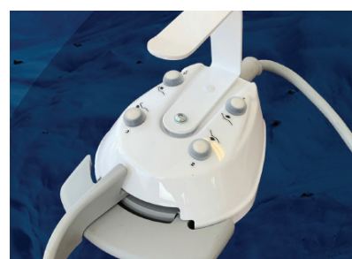
Foot pedal for Electric system