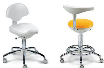
Doctor and Assistant stools