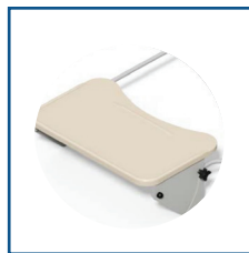
Tilting Patient Table