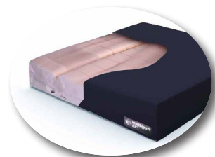
Includes Intelligent Air Cushion