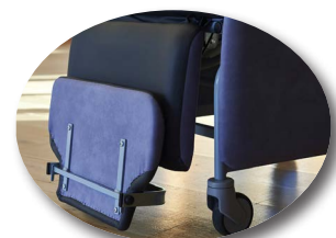
Optional Flip-up Footrest