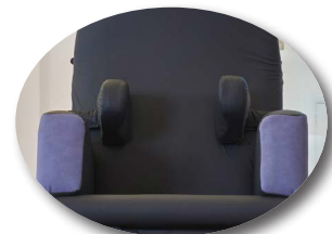
Adjustable Lateral Supports